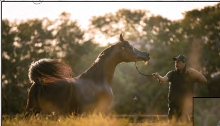
Rhaydee Serondella (*El Tino x Only Serondella) Brazilian National Bronze Champion Junior Mare