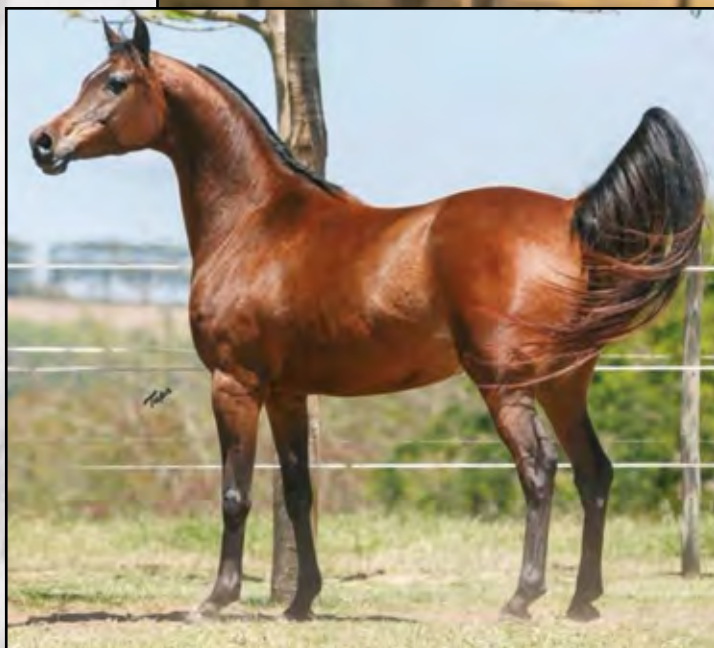
*Aria Shanteuse (Gazal Al Shaqab x G Shamaal by *Ali Jamaal) foundation mare and granddaughter of the legend Shahteyna

The first steps towards the objective to build the Serondella look could have already been noticed early on with the offspring of some of Only's daughters such as Samoah Serondella (by HP Ali) and her winning daughter Acqua Serondella (by Abbas Al Ventur) and Simply Serondella (by TS Khidam al Shawan, exported to Al Shaqab Stud in Qatar) and her champion son Amir Serondella (by Santorini), who will start breeding a group of mares very soon. The addition of Only's full sister Simoneta LF, was also a strong indication towards this plan.