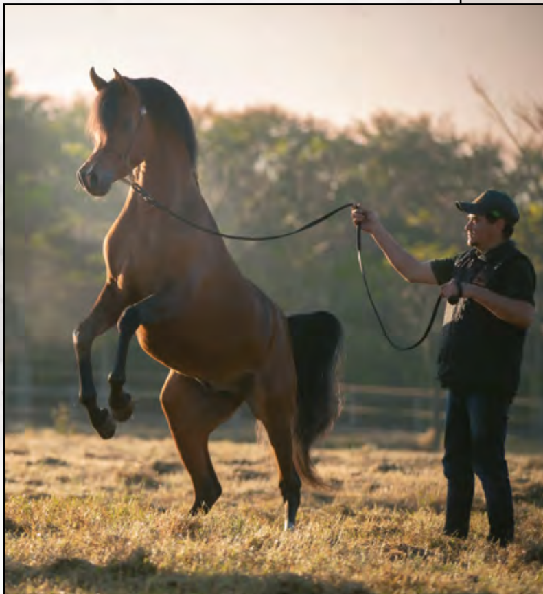
Vision Serondella (AF Maden x Only Serondella) the "Stallion" version of Only Serondella

after bloodlines including daughters and granddaughters of Elle Dorada, Eloise el Jamaal, Perfechsahnn SRA and Julliye el Ludjin.