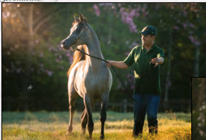
Barilla Serondella (WH Justice x Lumiar Elektra) exported to Al Kaisar Stud