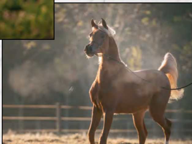
Alisha Serondella (Abbas Al Ventur x Rhavina Serondella by Gazal Al Shaqab)