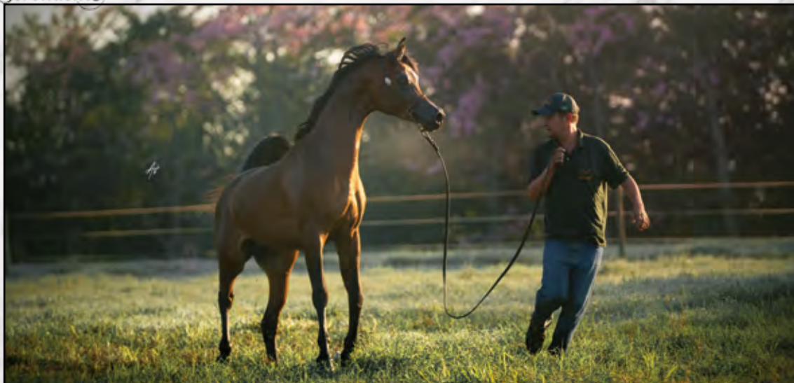
Amir Serondella (Santorini x Simply Serondella) 2x Brazilian National Champion and future Stallion of Haras Serondella