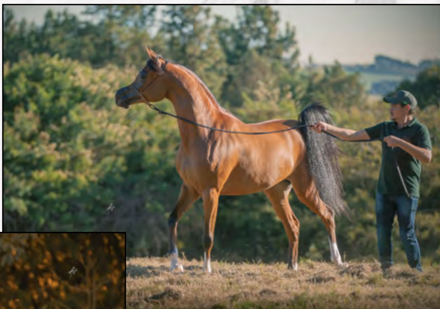
Samoah Serondella (*HP Ali x Only Serondella)