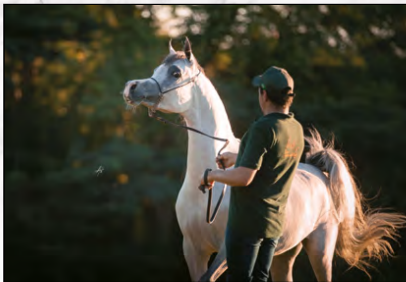
Zenyatha Serondella (*HP Ali x Simply Serondella)

developed his breeding program, many times picking mares and stallions that would not be an obvious choice to most, but that were my choices too.