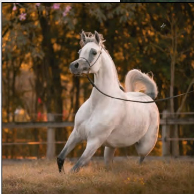
Simply Serondella (TS Khidam El Shawan x Only Serondella) exported to Al Shaqab Stud, Qatar