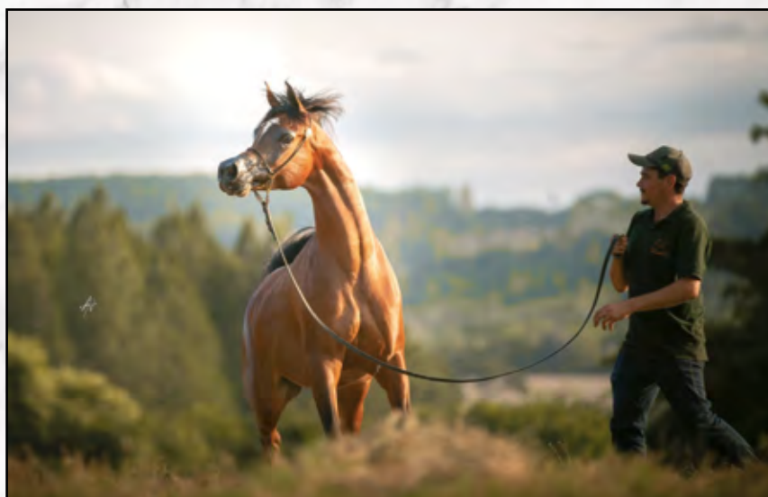
Only Serondella (*AAS Elishahh x Jelabie Serondella) 5 x Brazilian National Champion