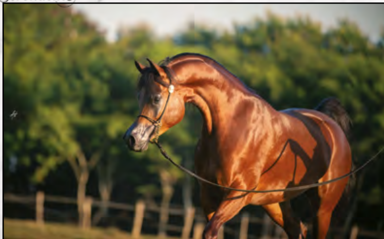
Ultraah Serondella ▲ (Quasim CRH x *Aria Shanteuse by Gazal Al Shaqab) 3x Brazilian National Champion and dam of Almaah Serondella (2x Brazilian National Champion)