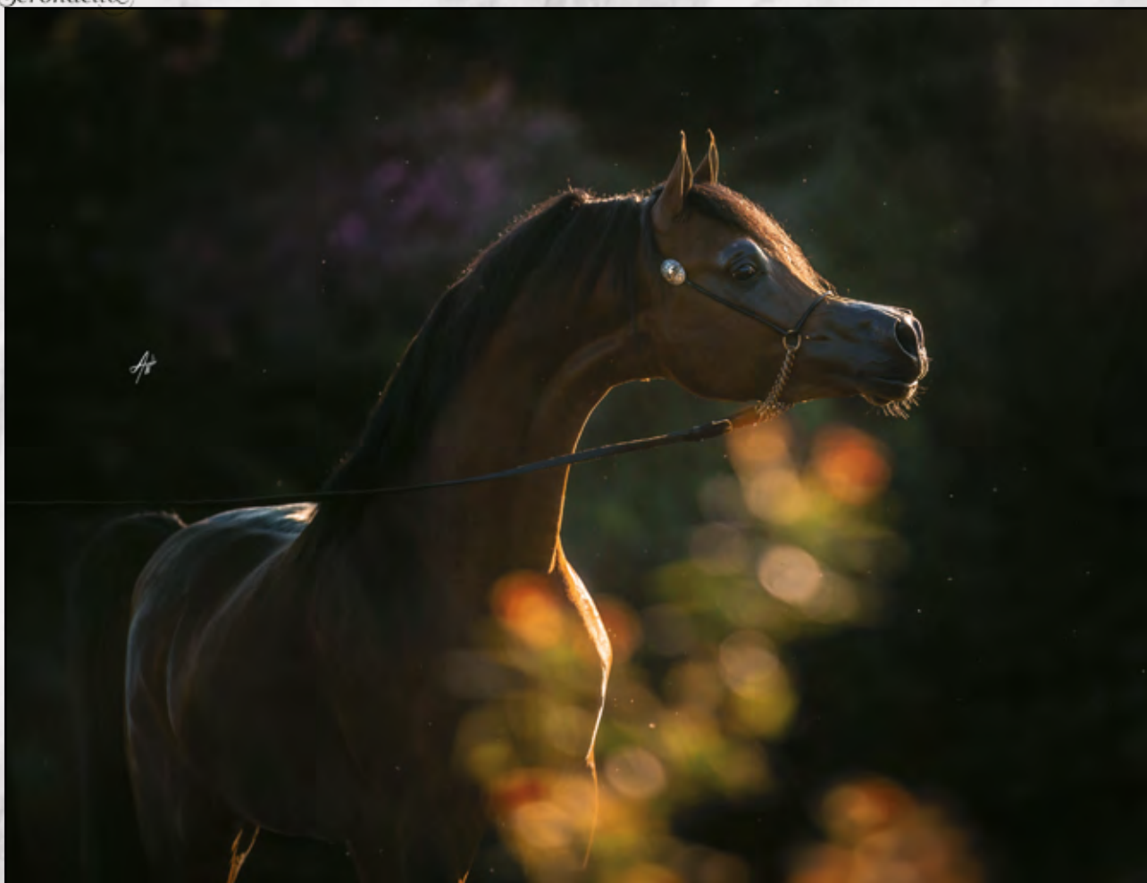
Vision Serondella (AF Maden x Only Serondella) Brazilian National Champion and Chief Sire of Haras Serondella