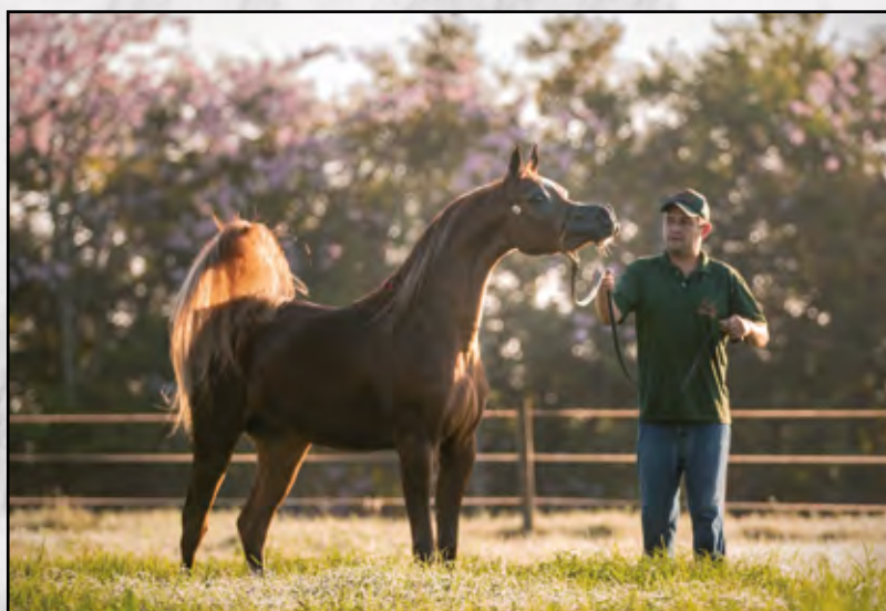
Acqua Serondella (Abbas Al Ventur x Samoah Serondella) Brazilian Sensation and 2x Brazilian National Champion