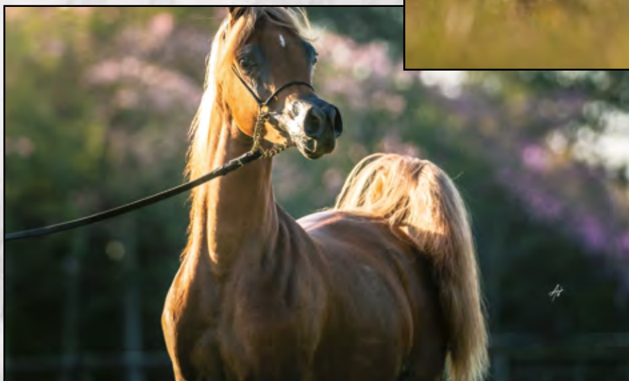
Bonitah Serondella (*GT Shardh x Queen Elsa FWM by *FA El Shawan) Unanimous Gold Champion of the International Show in Brazil

Some decisions might align with the general outside trend and some might not. But they are all made in the service of the vision they believe in. And breeding decisions will always prevail over the showing appearances.