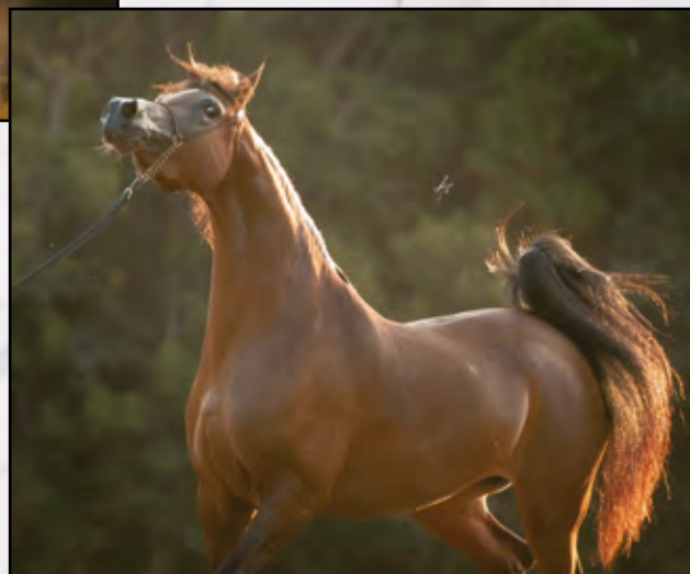
Simoneta LF (*AAS- Elishahh x Jelabie Serondella) full sister to Only Serondella and Brazilian National Gold Champion Junior Mare